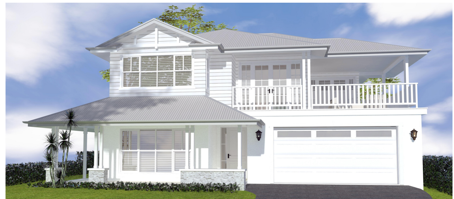
MODEL PERSPECTIVE VIEW STANDARD PLAN